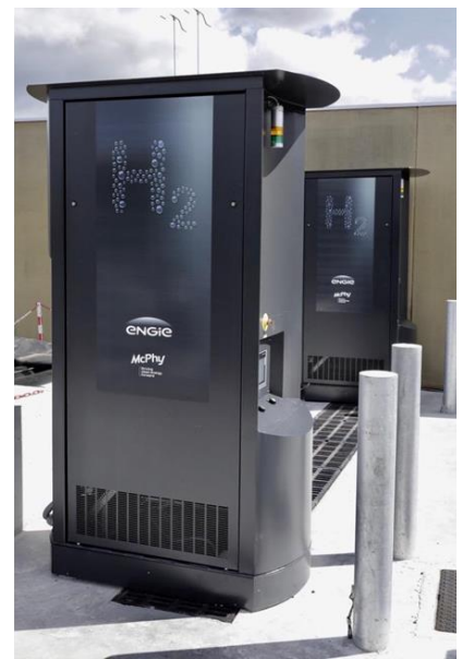
Bus station with hydrogen production: McPhy technologies