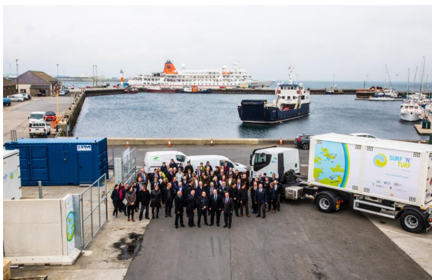
Destination Kirkwall: The current Shapinsay ferry with the chosen route for HYSEAS III project in the background. HYSEAS III will combine with Surf N Turf hydrogen project to provide the replacement vessel with a Hydrogen fuelling facility

The successful test will allow a vessel to be constructed, in the already assured knowledge that such a vessel can operate safely and efficiently around Scotland’s challenging coast. The vessel is planned to operate in and around Orkney - which is already producing hydrogen in volume from constrained - and hence otherwise wasted - renewable energy.